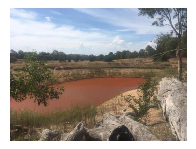
Red Algae on the dam

Parks have upgraded the fire and walking trail and the entry fencing from the Mannheim entrance.