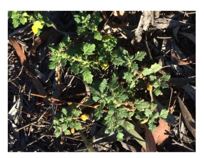
Crumbweed (Chenopodium pumilio) now known as Dysphania pumilio)

Over the past few weeks I have noticed a small herb growing in many places on the Ridge. I first saw it years ago on the Ridge, and have not seen it since. I knew it as Chenopodium pumilio, but now it is known as Dysphania pumilio. This native aromatic plant has mealy-textured leaves, and grows about 10cm high. It grows in disturbed and bare soils, and can be found in gardens and roadsides. It is now considered an exotic weed in Europe and was probably introduced via Australian wool imports.