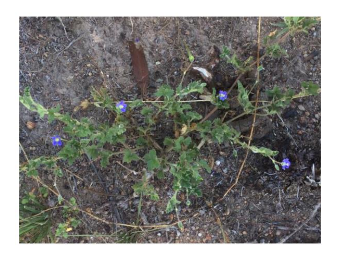
Blue Crowsfoot

Uncommon but widespread in our area, its leaves, roots and seeds were eaten by the Aborigines. It is easily distinguished from the exotic version as it is the only one with blue flowers. The exotic ones have pink flowers.